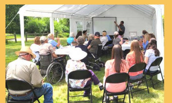
Volunteer Appreciation Luncheon