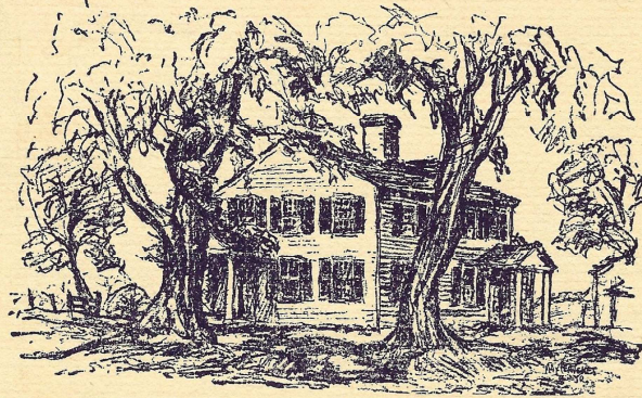
OLD INDIAN AGENCY HOUSE, PORTAGE, WISCONSIN, BUILT IN 1832 Restored by The National Society of Colonial Dames in the State of Wisconsin